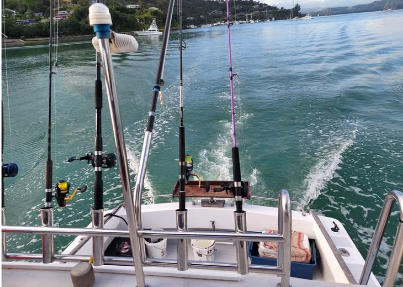
Team POSEIDON doing the NZSFC Nationals day 2 weighting in 2 kahawai in the light line classes. What will day 3 hold in for the team.