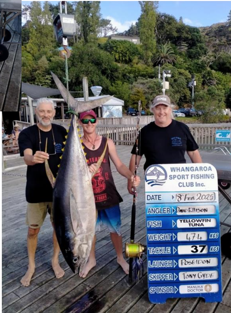
Team Poseidon for Big Fish Fishing Club