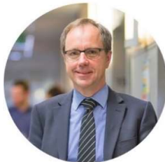
John Ryan Corporate Services